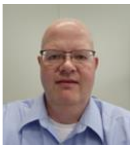
Dr. Dirk Pfeiffer (IBM Yorktown Heights)

Panelist Bio: Dr. Dirk Pfeiffer manages a state of the art 200mm wafer scale nanofabrication facility at the IBM TJ Watson Research center in Yorktown Heights, NY, offering a wide range of design and fabrication services, ranging from novel devices fabrication to packaging, test, design, characterization, electronics, system integration and assembly. The laboratory supports a broad range of projects to develop new computing technologies for IBM including quantum computing, neuromorphic devices for AI based computing architectures, and unit process development for semiconductor fabrication.