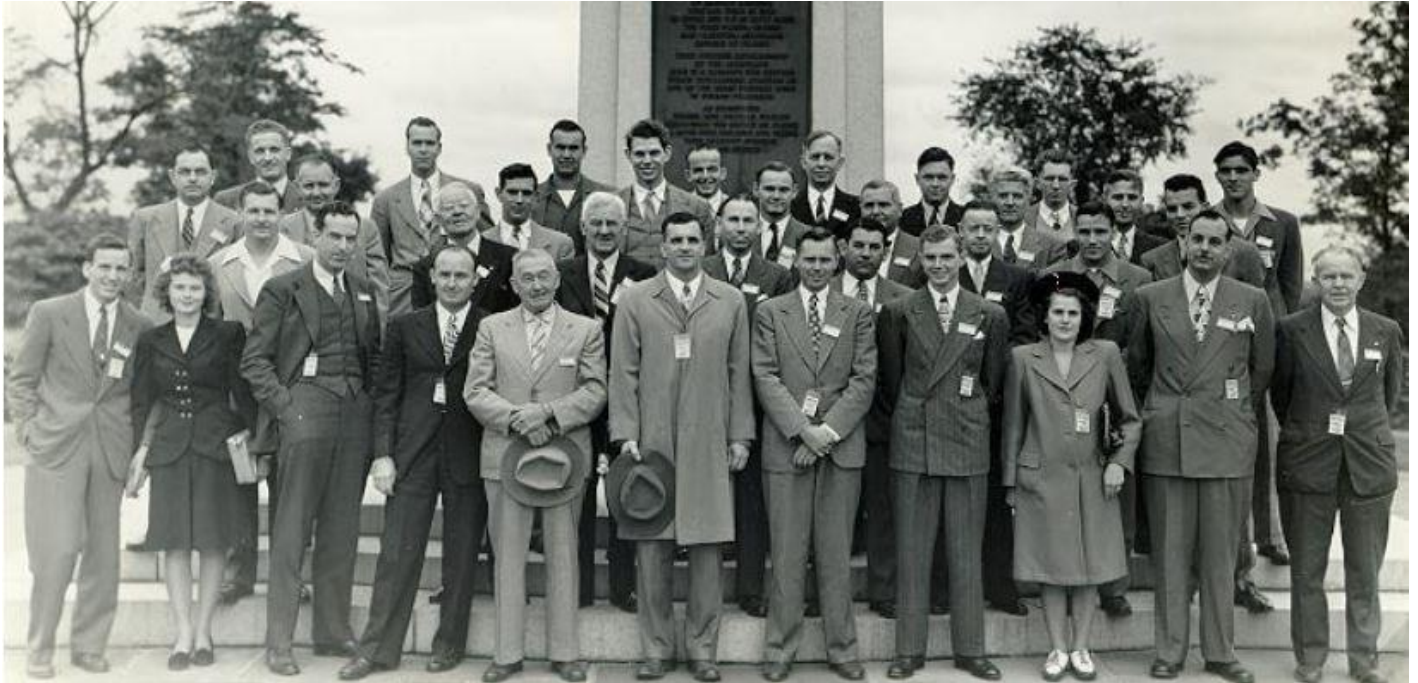
Founding members of NAECON

The National Aerospace and Electronics Conference (NAECON), which had its beginnings in the Fall of 1947, is the oldest and premier IEEE Conference representing research in all aspects of aerospace systems and sensors. Since 2008, NAECON has explored new research and contributions for core intelligent aerospace sensor integration in the following areas: