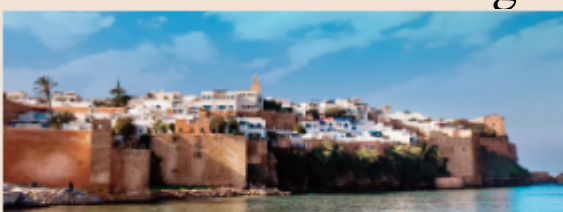
Discover Morocco - Medinas of Morocco | Moroccan National Tourist Office

Roam through the medinas of the imperial cities, soak up the culture and the colours of its winding alleys, and refresh yourself with a thirst quenching tea